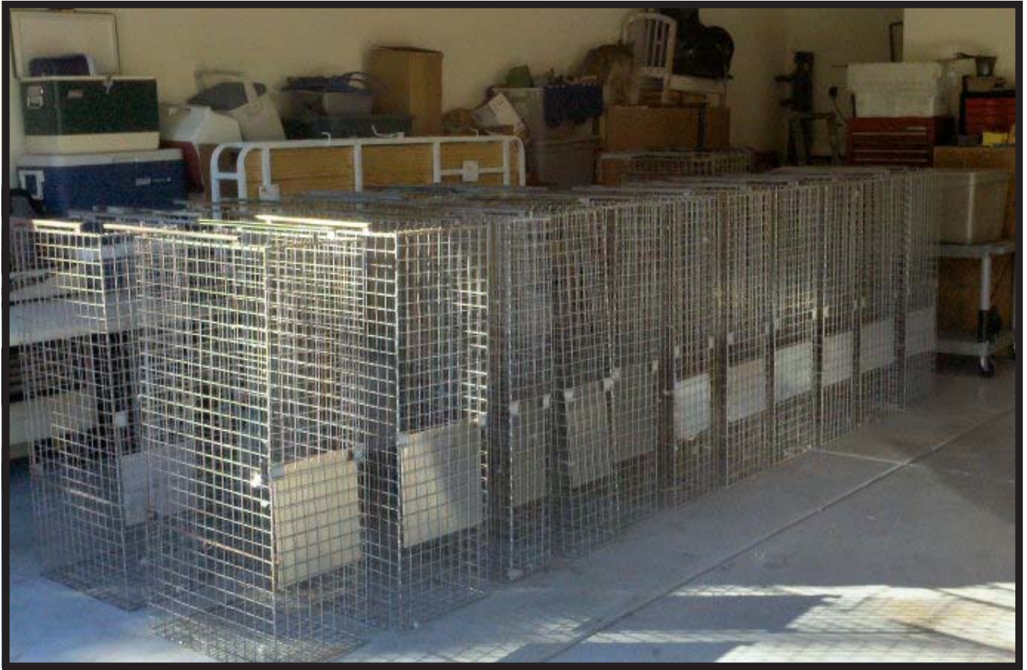
Scott's garage and his many cage traps.

Scott's bobcat after removal from the cage. Note the cage location, wedged back into brush.