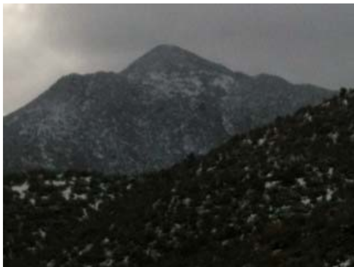
Had to go over this mountain before determining I should come back to make the check in Saturday night.