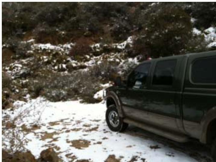
Getting into the snow.